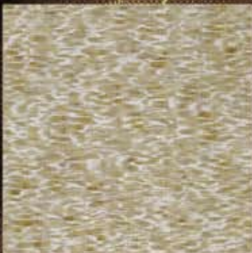
PT065 - Topaz Illusion