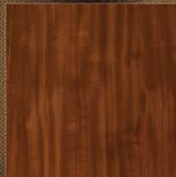
WN803 - Umber Chestnut