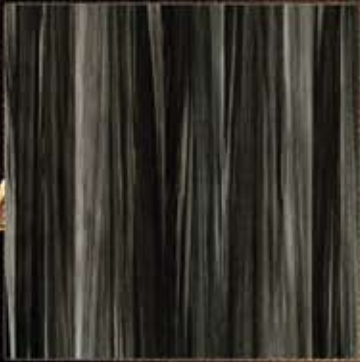
WX430 - Night Sky Silkwood