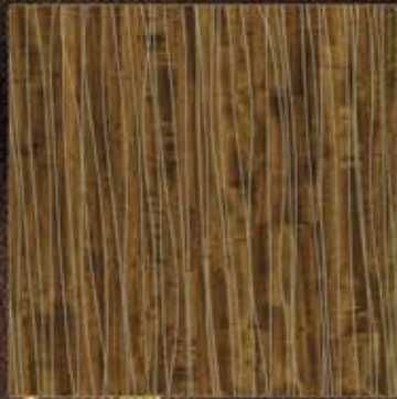
WX721 - Butterscotch Comet