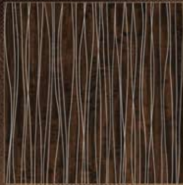
WXC01 - Brandy Comet