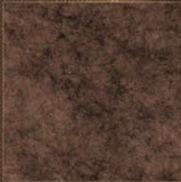
PO075 - Copper Batik