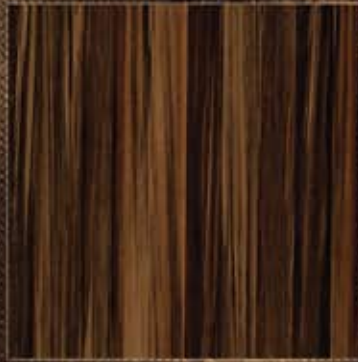
WX437 - Tiger Eye Silkwood