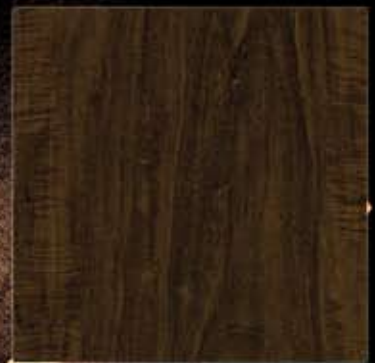
WX410 - Coffee Satinwood