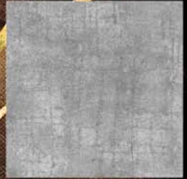
PG043 - Platinum Leaf