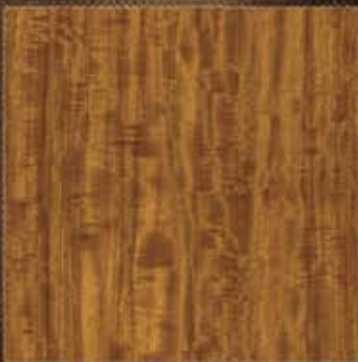
WX721 - Butterscotch