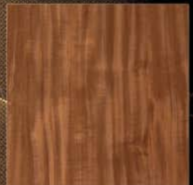
WN805 - Cinnamon Chestnut