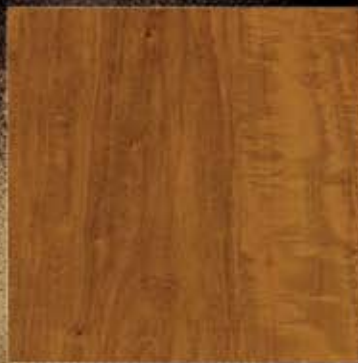
WX405 - Butterscotch Satinwood