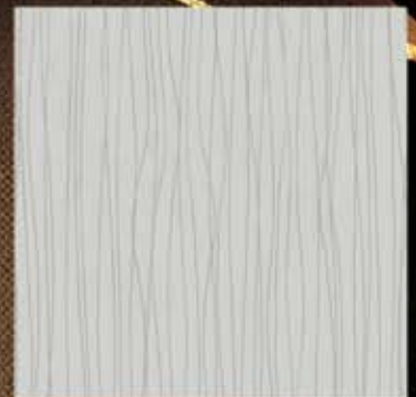
PW009 - Ice Comet