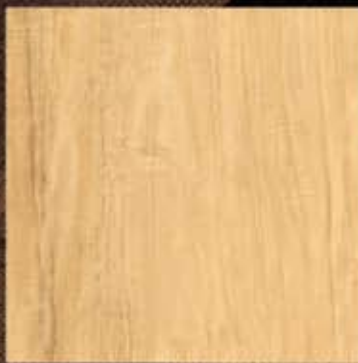
WX400 - Cream Satinwood