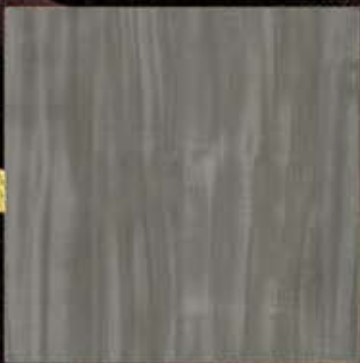
WN807 - Pearl Chestnut