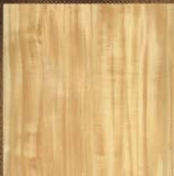
WN801 - Silky Chestnut