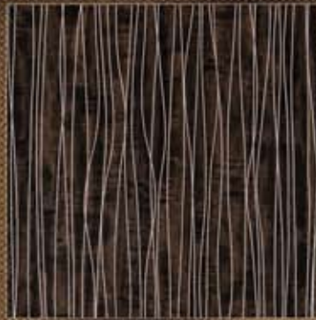
WXC05 - Coal Comet