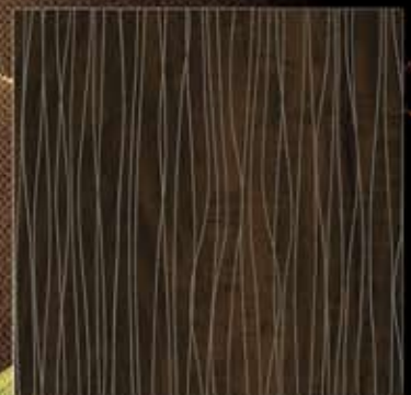
WXC11 - Coffee Satinwood Comet