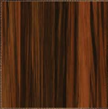
WX435 - Ember Silkwood