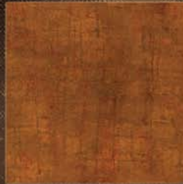
PO100 - Copper Leaf