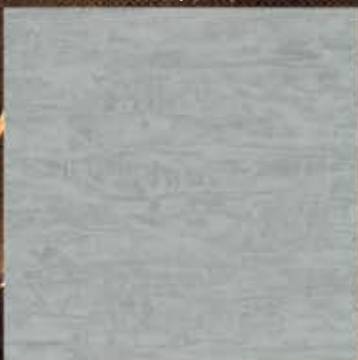
PW015 - Ice