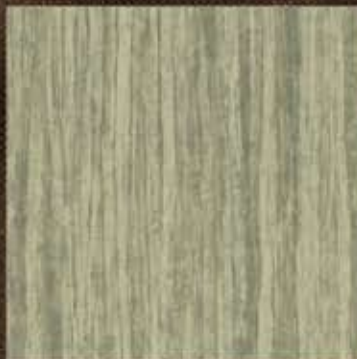
PV111 - Juniper Bark