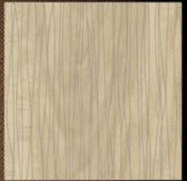
WXC07 - Cream Satinwood Comet