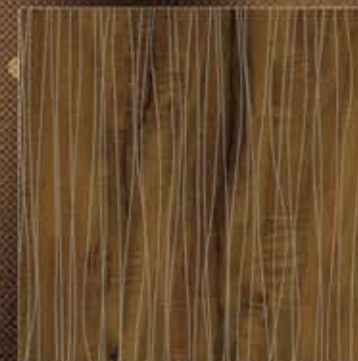
WXC09 - Butterscotch Satinwood Comet