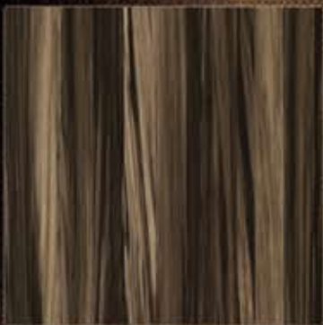
WX441 - Terra Silkwood