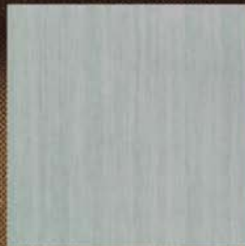
PW005 - Birch Bark