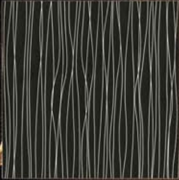
PE003 - Twilight Comet

The sleek look of these LGS panels can bring an added dimension of beauty and inspired design to any room, and they lend themselves easily to a number of different uses: as wall panels, room dividers, shower walls, countertops and so much more. These eye-catching and easy to clean panels are created from specially patterned paper that has been laminated between two sheets of glass, bonding the three pieces into a solid panel. The pattern of the paper appears with clarity and richness, while the glass gives it a sense of depth and shine.