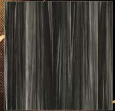
WX439 Charred Silkwood