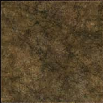
PO070 - Iron Batik