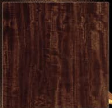
WX742 - Brandy