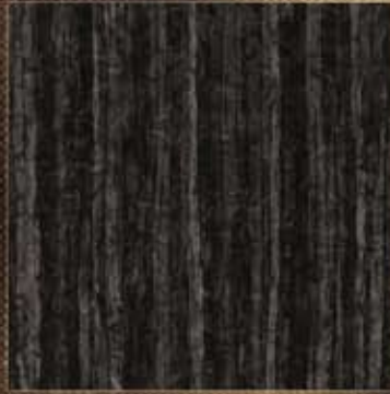
PE021 - Ebony Bark