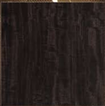
WX731 - Coal