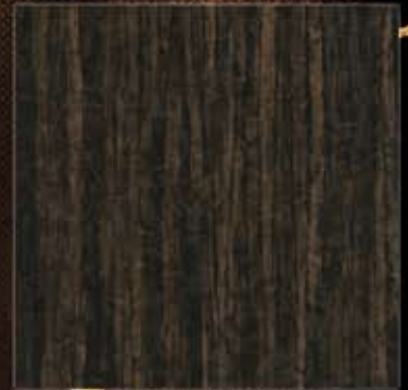
PT061 - Walnut Bark